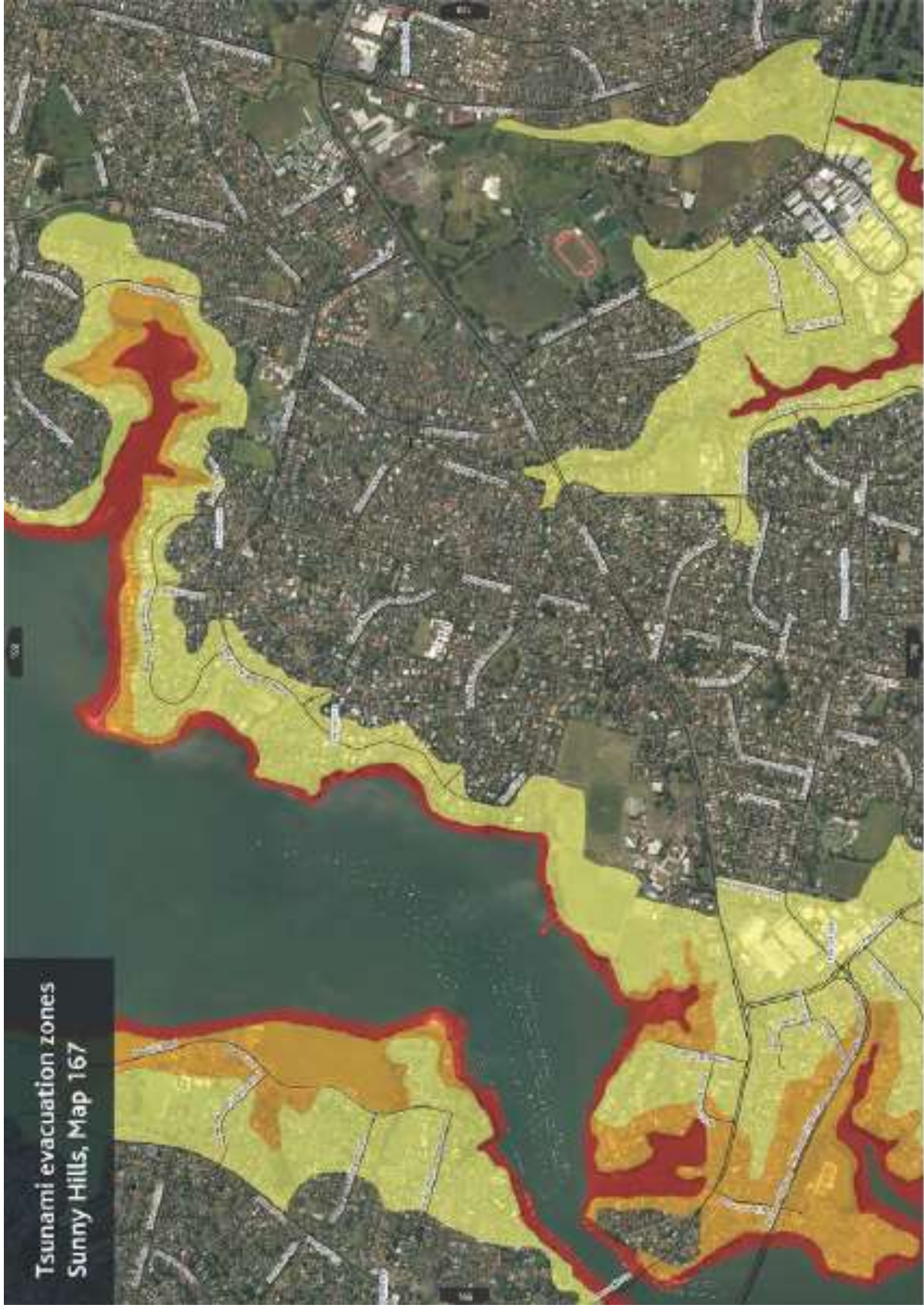
Tsunami evacuation zones Sunny Hills, Map 167