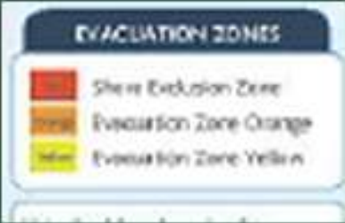
Tsunami evacuation zones Howick, Map 159